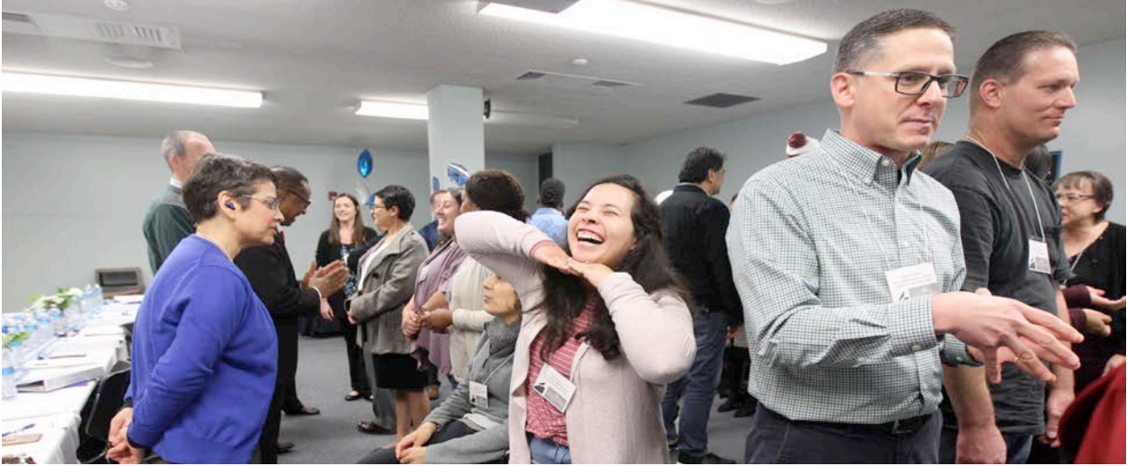
Coyote Career Network mentors and mentees engage in the speed networking activity